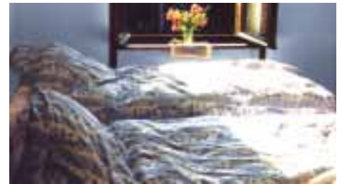
Twin bedded room