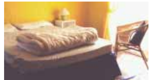
Large double bed room

East is the Regional Park and Forest of the Suisse Normande, which are most attractive.