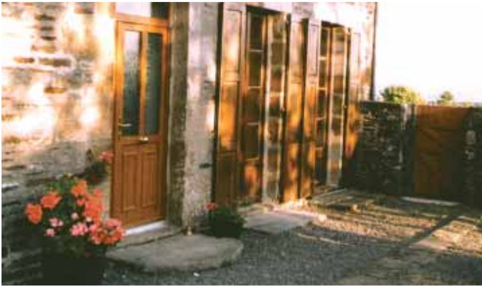
Front door and flowers