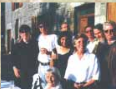
The house has accommodation for up to ten people, either one or two families

In the summer tennis and an outdoor swimming pool are at Mortain, a 20 minute drive across country. It is a historic and picturesque little town, with its famous waterfalls and ancient monastery, now an interesting museum.