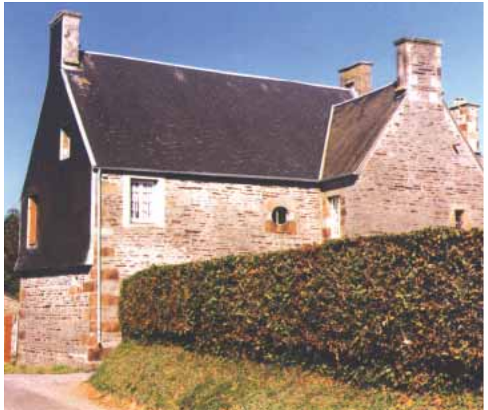
The house viewed from the lane

The salon has a 4 piece suite and coffee table plus wood burning stove.