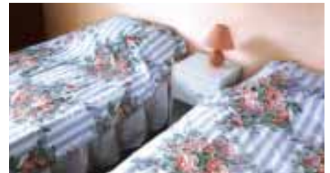
Small twin bed room