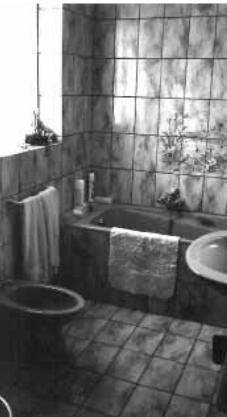
Fitted bathroom, bath with shower, bidet basin & toilet

18 hole golf course open to the public, and a restaurant.