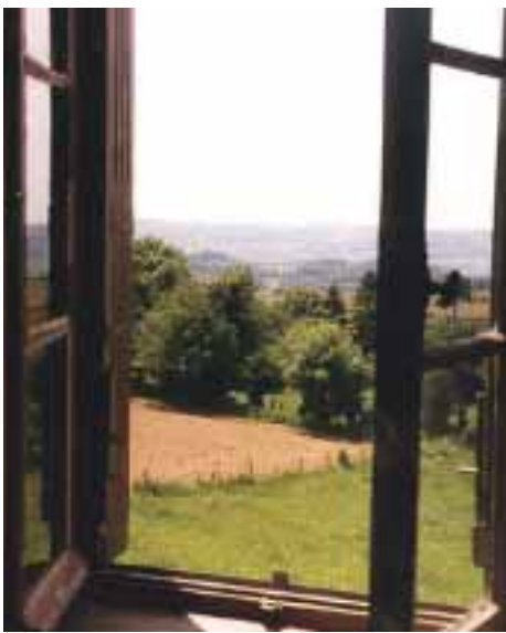
View from main bedroom window