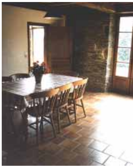
Dining room with french windows to garden