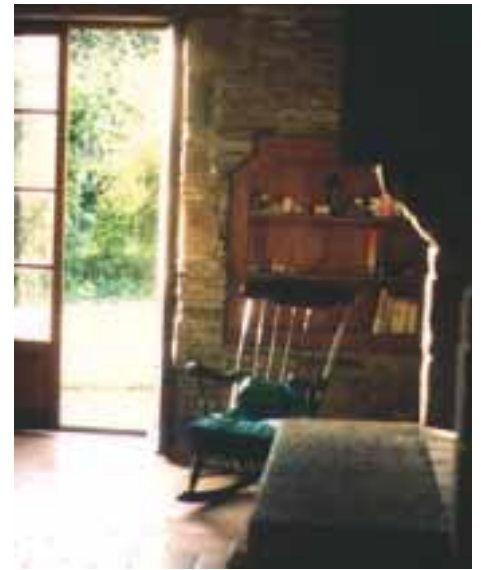
Corner of the dining room

The House Folder contains details of many places of interest for short or day long trips in this fascinating area of northern France.