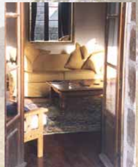
Living room with french windows to garden

A drive of approximately 50 minutes along country lanes take you to Granville, a charming family seaside resort, with beaches to the north and south, or to Avranches, which overlooks Mont St Michel.